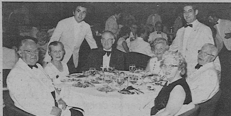
Relaxing aboard the M/S Sea Venture

For a relaxing fun filled vacation with congenial friends, why not consider the Empire State Masonic Cruise to the Caribbean January 4 - 17. There are at present, eleven from the two Monroe Districts signed up. Anyone interested in joining the group may call the Masonic Service Bureau, 473-5351 for information about a get-together early in September.