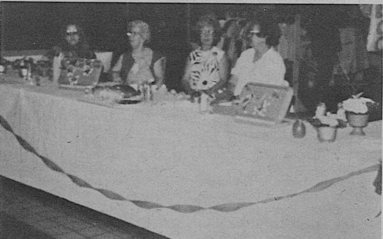
Fidelity Triangle Booth at Greece Town Mall Charity Bazaar.

To our many supporters who by their generous gift of the used stamps from envelopes, the members of the Rochester Masonic Stamp Club wish to give due recognition. It is only by their efforts in forwarding to us the many pieces of stamped paper that we are able to fill the needs of the Masonic Home Stamp Club at the Masonic Home in Utica.